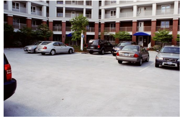
Typical upper level parking deck with waterproof, traffic bearing membrane applied to protect lower parking levels.

Elastomeric deck coatings (CSI Division 7), which are found in construction applications around the world, serve a dual purpose. The first is to waterproof and the second is to provide a traffic bearing surface. Whereas the first requirement can be effectively met with any number of low cost roofing materials, the second one effectively limits the selection to higher performing compounds. A variety of flexible urethane, epoxy and acrylic formulations, applied in multi-layer coatings, are typically used to meet these dual requirements. For example, an aromatic urethane base coat serves as the waterproofing layer and is then protected by a top coat of a more durable, weather resistant aliphatic urethane. Manufacturers spent significant R&D resources to develop the coatings and application techniques to satisfy these dual requirements, and detailed technical specifications and test results were published for them.